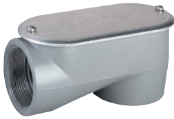
SLB-1 thru 7