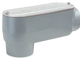
SOLB-8, 9, 0