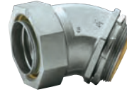
K20041 45° Insulated