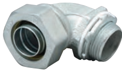
K0759 90° Non-Insulated