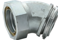
K2004 45° Non-Insulated