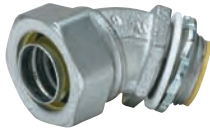
K07591 90° Insulated