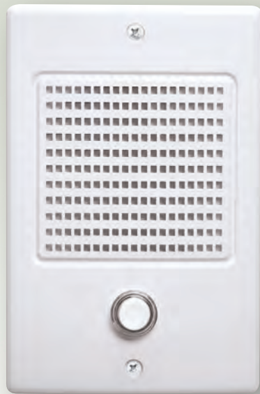
NDB300WH – Door Speaker