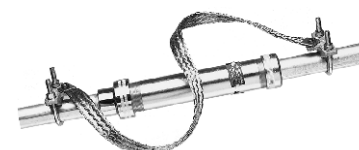
XJG shown with optional bonding jumper