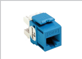
Datacomm, Audio, & Video