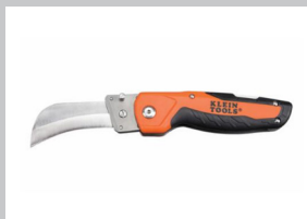
Tools & Testing