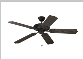
Seasonal & Specialty