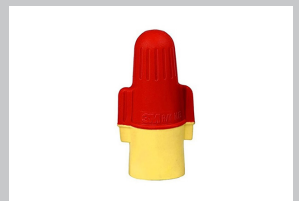
Wire & Wire Management

OVER 80,000 PRODUCTS AVAILABLE ANYTIME AT STATEELECTRIC.COM