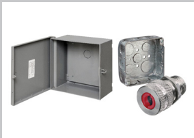
Boxes, Fittings, & Enclosures