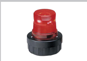
Safety, Security & Janitorial