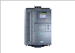
Automation & Control