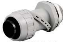
PSO509NGY - Swivelok