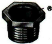
Steel or malleable