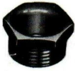
Steel or malleable iron or aluminum.