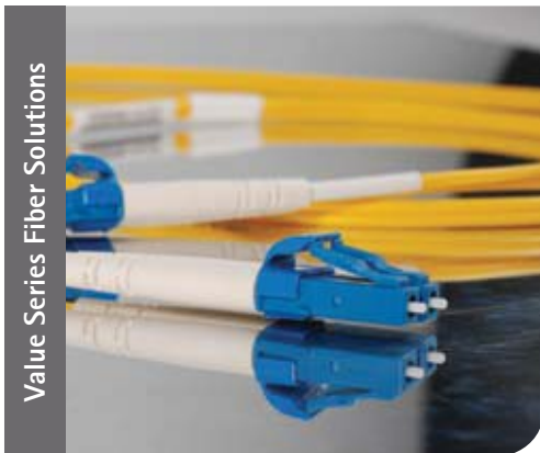
Value Series Fiber Solutions