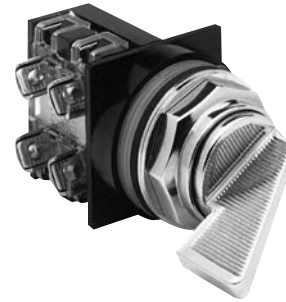
Lever-Operated Selector Switch

Suitable for use in NEMA Type 1, 3, 3R, 4, 4X, 12, and 13 applications, when mounted in enclosures rated for those same applications. For some NEMA Type 4X applications, protective caps will improve corrosion resistance.