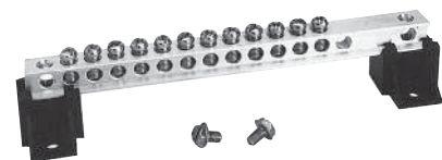
TGK12 with TGKIS