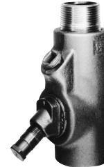
1 1/4" – 4" Male & female hub