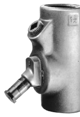
1 1/4" – 4" Female hub