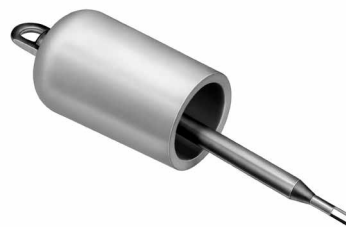
Figure 11. Catalog Number OT635

The installation torque tool is required to ensure proper torque when installing a 35 kV Class bushing adapter to a 600 A bushing interface. It is precision calibrated and hotstick operable.