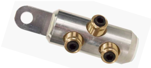
Figure 5. Shear bolt connector.

Bolted cable lug is fitted with stepless bolts, which shear off when optimum contact force has been reached. Provides electrical continuity for copper and aluminum conductors while eliminating need for dies and compression tools. Available in unthreaded aluminum for Eaton's Cooper Power series BOL-T™ and BT-TAP™ connector applications only. See Table 5.