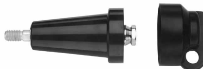
Figure 2. Insulating Plug with EPDM rubber cap.

Insulating Plug, available at 200 kV BIL