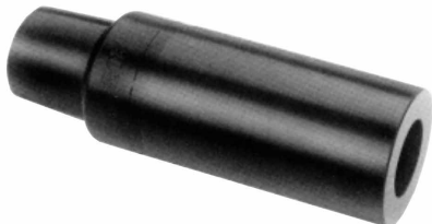
Figure 6. Cable adapter.

The molded cable adapter is available in sizes to fit cables from 0.875" to 2.36" in diameter (22.2 to 49.9 mm). Molded of high quality peroxide EPDM cured insulation and semiconductive rubber to provide stress relief for terminated cable. Refer to Table 6.