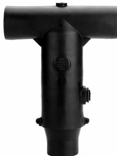
Figure 7. Molded rubber T-body.