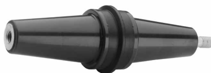
Figure 3. Connecting plug shown with stud.