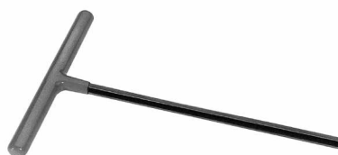
Figure 12. Catalog Number TWRENCH

The operating and testing tool is used with a hotstick to test for circuit de-energization and to install and remove a 35 kV Class LRTP equipped connector from an apparatus tap. The standard tool is equipped with a molded EPDM rubber cap to ensure tool seating.