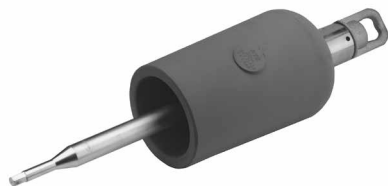
Figure 9. Catalog Number OTTQ635

To order 600 A, 35 kV Class deadbreak tools accessories, refer to Table 7.