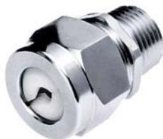
Machined Zinc-Plated Steel