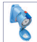
Female Receptacle with Angle Adapter 33-34043 + MP3