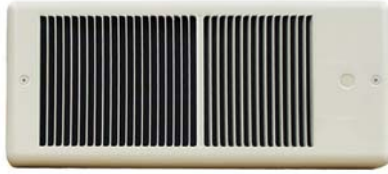
WITHOUT IN-BUILT THERMOSTAT