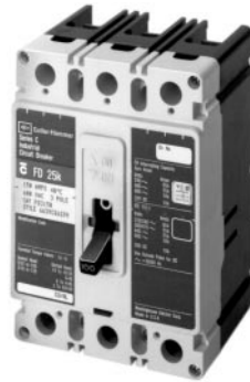
Typical F-Frame Breaker