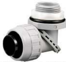
PSO509NGY - SwivelLok