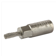
Aluminum Pin Terminal Cu Pin 1/0 AWG