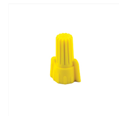
Easy-Twist™ Winged Yellow - Bulk