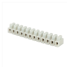
Terminal Block Insulated 20A 12 Circuit